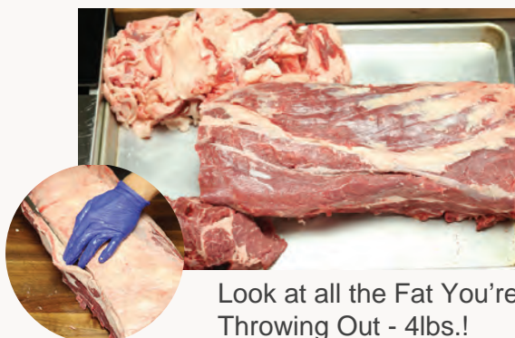
Look at all the Fat You're Throwing Out - 4lbs.!