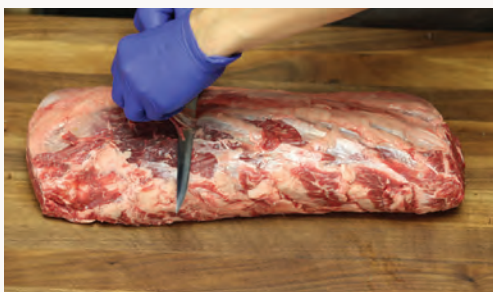
Ready to Portion Right Out of the Bag!